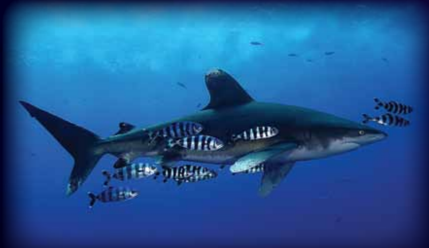
Oceanic Whitetip Shark Carcharhinus longimanus Vulnerable**