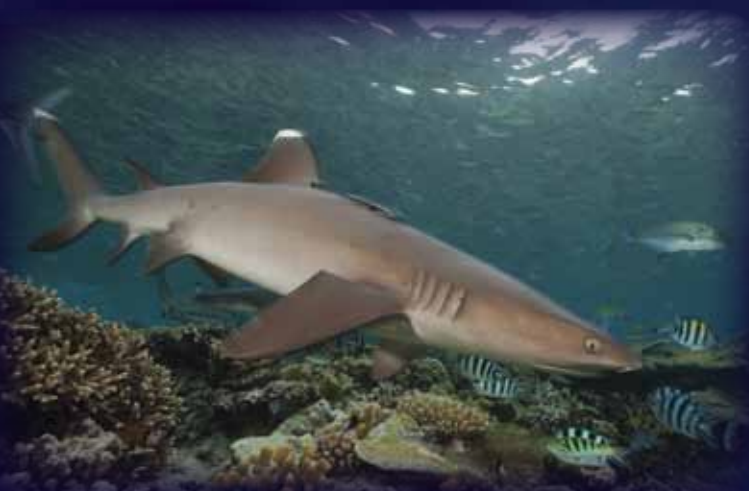
Whitetip Reef Shark Triaenodon obesus Near Threatened**