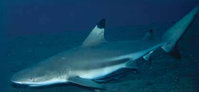
Blacktip Reef Shark Carcharhinus melanopterus Near Threatened**