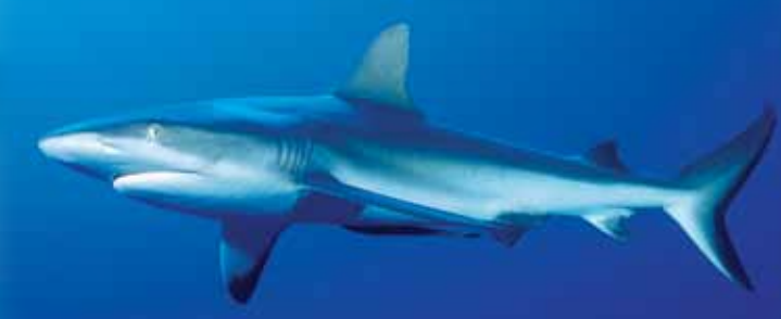
Grey Reef Shark Carcharhinus amblyrhynchos Near Threatened**