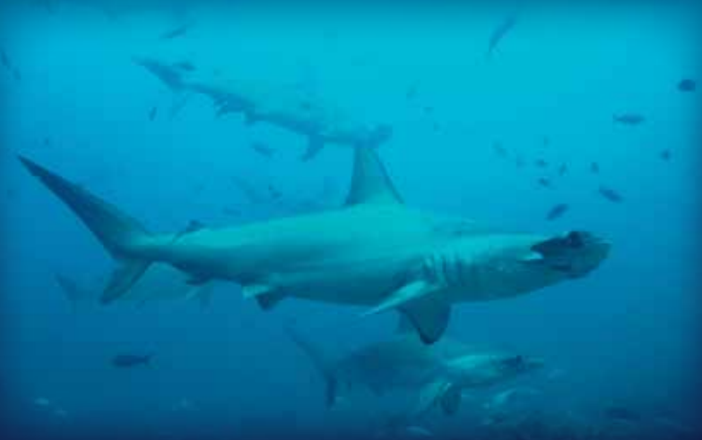
Scalloped Hammerhead Shark Sphyrna lewini Endangered**