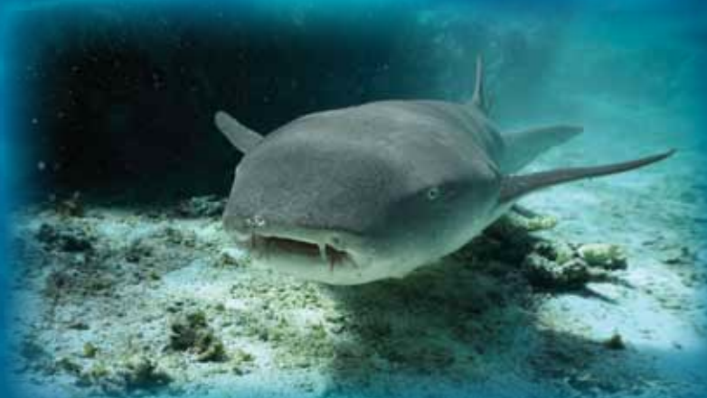
Tawny Nurse Shark Nebrius ferrugineus Vulnerable**