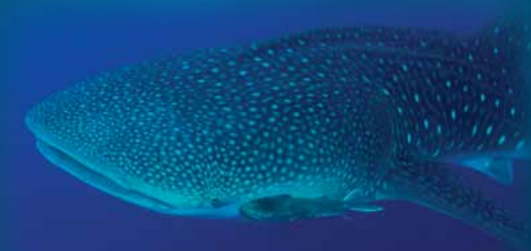
Whale Shark Rhincodon typus Vulnerable**