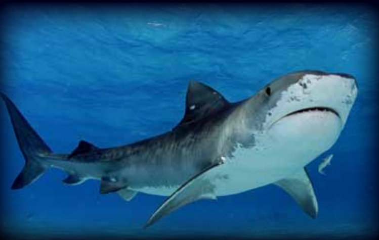
Tiger Shark Galeocerdo cuvier Near Threatened**