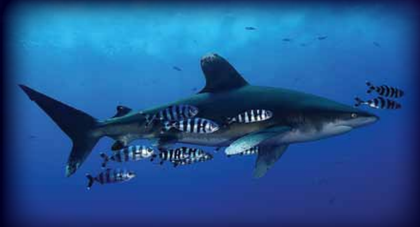
Qio Vulaki Carcharhinus longimanus Vulnerable**