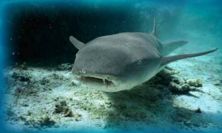
Qio Dramila Nebrius ferrugineus Vulnerable**