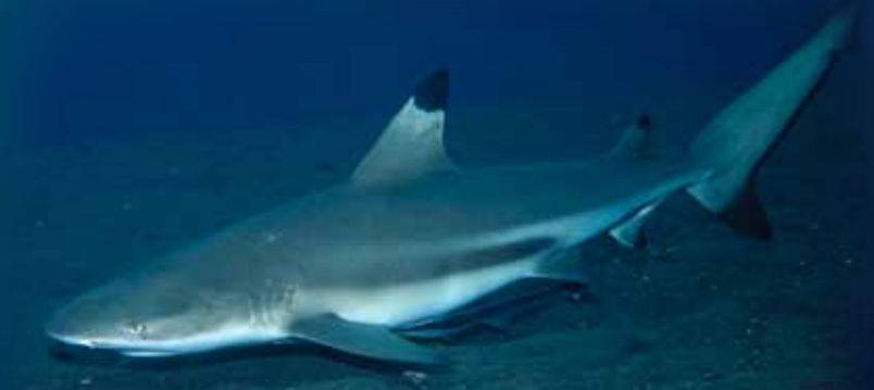
Qio Tukiloa Carcharhinus melanopterus Near Threatened**