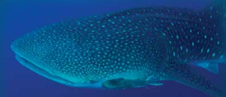
Qio Tovuto Rhincodon typus Vulnerable**

Ke o ni gadreva e so tale na kena i tukutuku ni yalo vinaka qai veitaratara mai ki na www.coral.org/sharks or www.pewsharks.org .