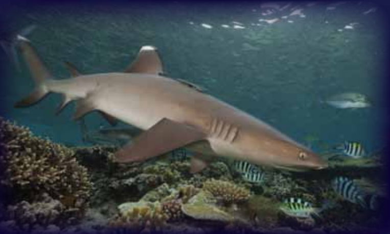
Qio Tukivula Triaenodon obesus Near Threatened**