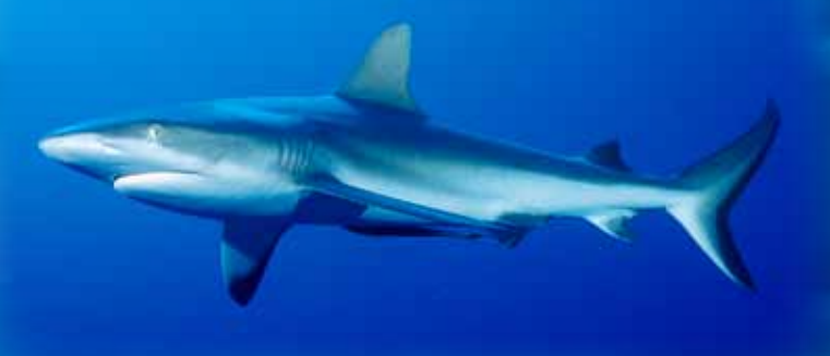
Qio Saqa Carcharhinus amblyrhynchos Near Threatened**